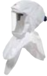
3M™ Versaflo™ S655/657/757/855E Reusable Suspension Hoods