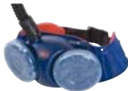
3M™ Jupiter™ Powered Air Respirator