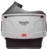
3M™ Versaflo™ TR-300 Powered Air Respirator