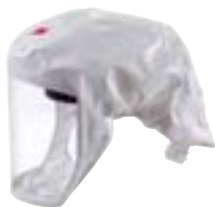
3M™ Versaflo™ S-133 Headcover General purpose, cost-effective fabric.

Ready to use straight out of the box. Permits fast replacement of soiled hoods Available in two adjustable sizes: Small (S) and Large (L)