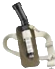
3M™ Cooling Vortex Assembly V-100