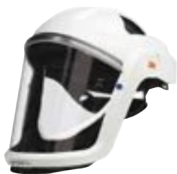
3M™ Versaflo™ M-100 Series Faceshields for respiratory, eye and face protection:

M-106 features a comfortable faceseal for dusts, spraying and chemical processing. Fabric material: polyurethane coated polyamide.