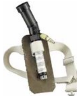
V-100 Cooling Vortex