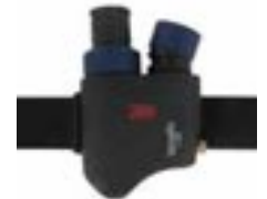
3M™ Versaflo™ V-500E Regulator