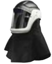
3M™ Versaflo™ M-406/407 Helmets with Shrouds