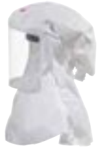
3M™ Versaflo™ S-433/533 Integrated Hoods