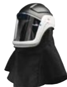
3M™ Versaflo™ M-400 Series Helmets with shrouds for respiratory, eye, face and head protection with additional neck and shoulder coverage:

M-307 features a flame resistant faceseal for applications with hot particles. Fabric material: flame resistant polyester