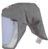
3M™ Versaflo™ S-333G Headcover Soft, quiet, more durable low-linting fabric.

Fabric material: Polypropylene coated non-woven polypropylene. Visor material: PETG.