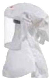
3M™ Versaflo™ S-433 Hood Includes neck and shoulder coverage.

Fabric material: Polyurethane coated knitted polyamide. Visor material: Coated polycarbonate. for increased chemical and scratch resistance.