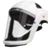
3M™ Versaflo™ M-106/107 Faceshields