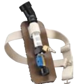
V-200 Heating Vortex

Please see the data on the headtop used with the unit for information on protection factors.