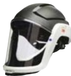
3M™ Versaflo™ M-300 Series Helmets for respiratory eye, face and head protection:

M-107 features a flame resistant faceseal for applications with hot particles. Fabric material: flame resistant polyester.