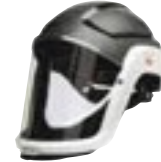
3M™ Versaflo™ M-306/307 Helmets