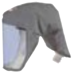
3M™ Versaflo™ S-133/333G Integrated Headcover