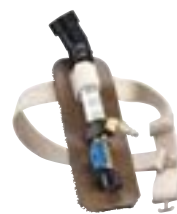
3M™ Heating Vortex Assembly V-200