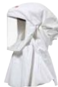
3M™ Versaflo™ S-533 Hood Neck and shoulder coverage with soft, low-linting fabric that more readily drapes over user.

Fabric material: Polypropylene coated non-woven polypropylene. Visor material: PETG.