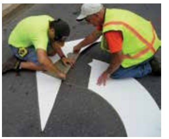
Clean, lay out and adhere

Stamark Symbols & Legends adhere to properly prepared pavement surfaces above 15 degree celcius is almost as easy as peel, apply and tamp. 3M Symbols & Legends can also be inlaid into hot asphalt at 65 degree celcius for an even stronger and durable life cycle.