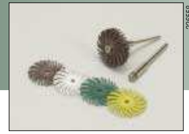
1" Radial Bristle Disc