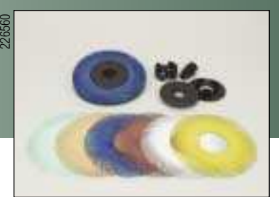
2" and 3" Radial Bristle Discs, T-C