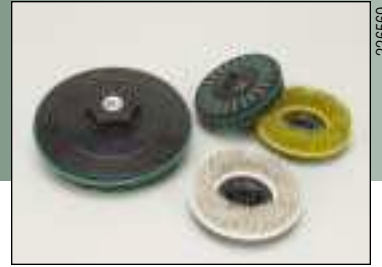
4.5" and 7" Roloc Bristle Discs

1.5" Bristle Disc, grade 50, removing paint from aircraft wing.