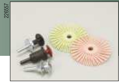
SR Radial Bristle Discs