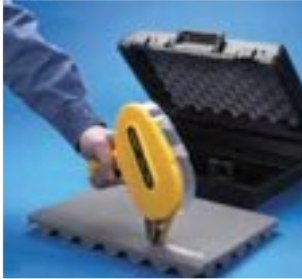
High performance Scotch® ATG Tape 926 bonds foam cushioning inside a portable power tool carrying case.

With Scotch® ATG Hand Dispenser 700 a touch of the finger triggers a quick, controlled application of Scotch® ATG Tape at the same time as the liner rewinds into the applicator. There is no mess and no cleanup. 3M advanced acrylic adhesive bonds on contact and is formulated with a choice of properties such as high temperature resistance, differential tack, adhesion to low surface energy plastic and more.