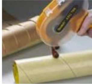
Scotch® ATG Tape 924 is ideal for core starting most paper stock.